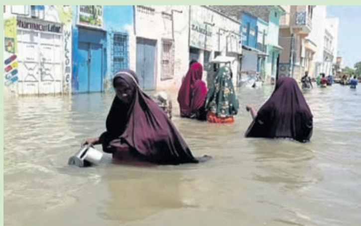
In this image made from video taken Sunday, May 17, 2020, people wade through a flooded street in Beledweyne, central Somalia.